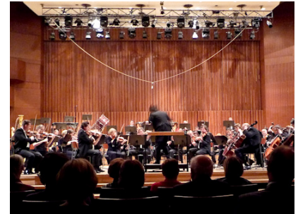
Zagreb Philharmonic Connecting to the Performance

From a manufacturer's perspective, the time spent not only helps the distributor with his dealers and customers, but, also is a wonderful opportunity to build a stronger relationship with the distributor.