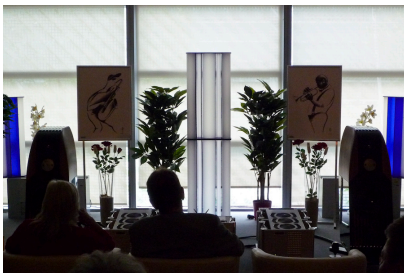
WOD Audio Room Kharma, Chord and Elation!

I have fun every year at the Munich Show! As I have reported before, it is a great venue that lends itself well to an audio event. But the real magic for me is the sheer joy of working with a distributor like WOD Audio.